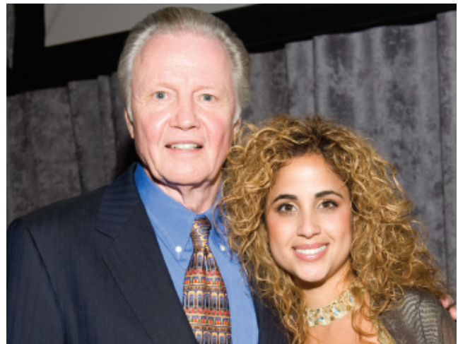
John Voight, Israeli singer Liel Kolet

In his address as keynote speaker, Mayor Giuliani reiterated the fact that Israel is the only democracy in the Middle East and therefore the only true ally of the United States in the region. Mayor Giuliani encouraged event attendees to visit Israel and praised the crowd for their support of the IAF